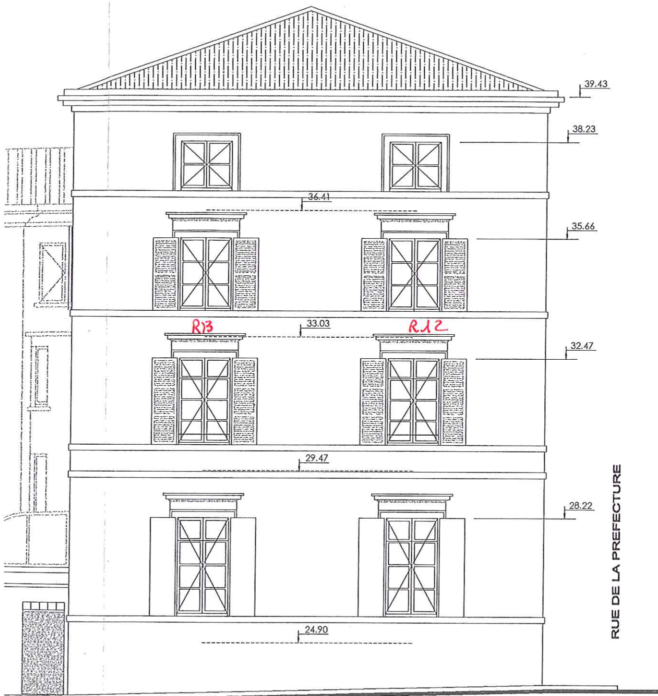
FACADE 3 RUE DU GUESCLIN